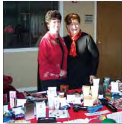
The Avon Booth at the Northern Hills American Country Christmas Celebration