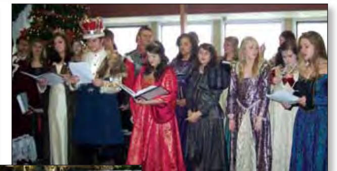
North High School Madrigals at Northern Hills