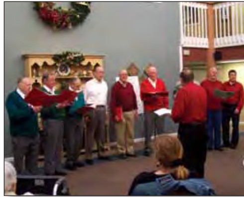
The Barbershop chorus performs at Northern Hills American Country Christmas Celebration

They say a picture is worth a thousand words. We have certainly had our share of good times over the past few months. (just look at all the great photos) As I write this newsletter, I am watching the snow fall, my cup of hot cocoa on my desk and looking out at the beautiful Christmas decorations here at Northern Hills. We have been enjoying a lot of great entertainment through out the month of December and still have a good share of fun and parties to experience.