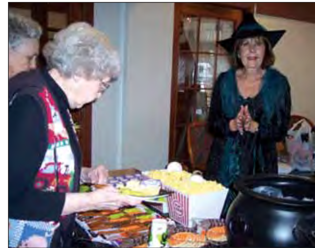
Halloween Party Treats!!!