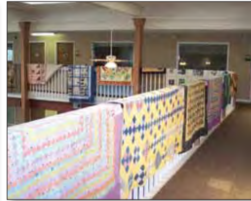
Northern Hills Quilt Show