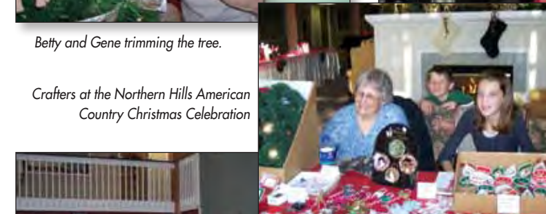
Crafters at the Northern Hills American Country Christmas Celebration