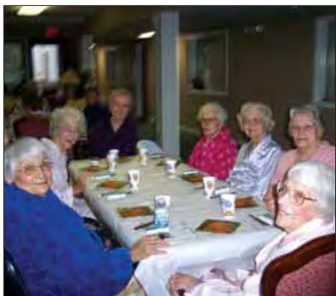
Ladies Pajama Party Brunch