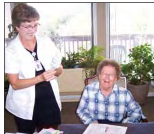
Flu Shots at Northern Hills...Ouch!!