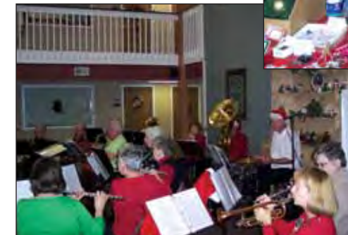
The New Horizons Band performs at Northern Hills American Country Christmas Celebration